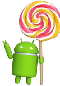
Android 5 LOLLIPOP