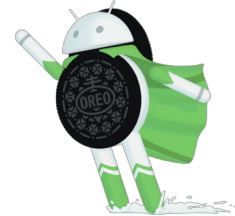
Android 8 OREO