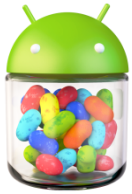
Android 4.3 JELLY BEAN