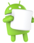
Android 6 MARSHMALLOW