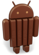
Android 4.4 KIT KAT