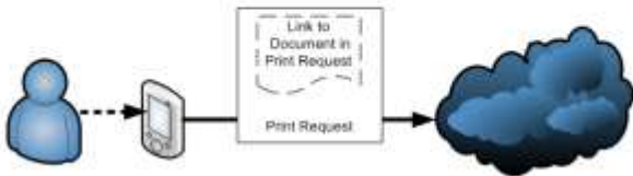
b) Cloud Print by Reference: User device includes document content link in request