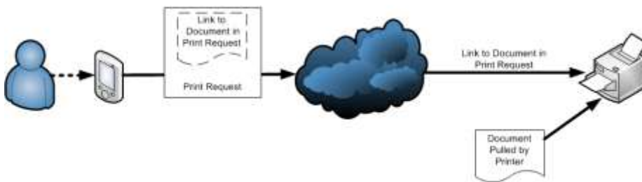
b) Printer device pulls document content