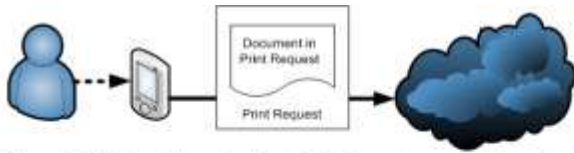
a) Cloud Printing: User device includes document content in request